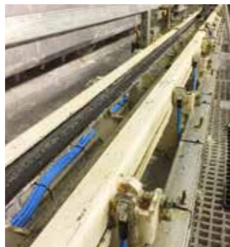
2 Cabling to earthing cabinet