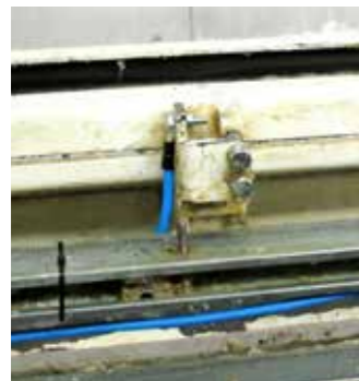
1 Connection of functional earthing system to painting booth