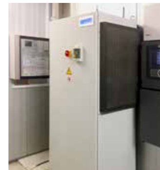
4 Earthing cabinet