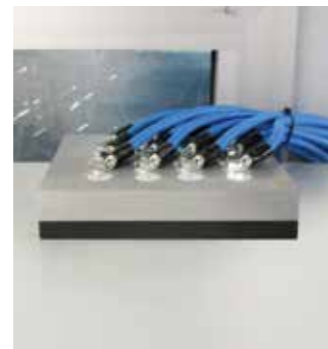
3 Connection to earthing cabinet